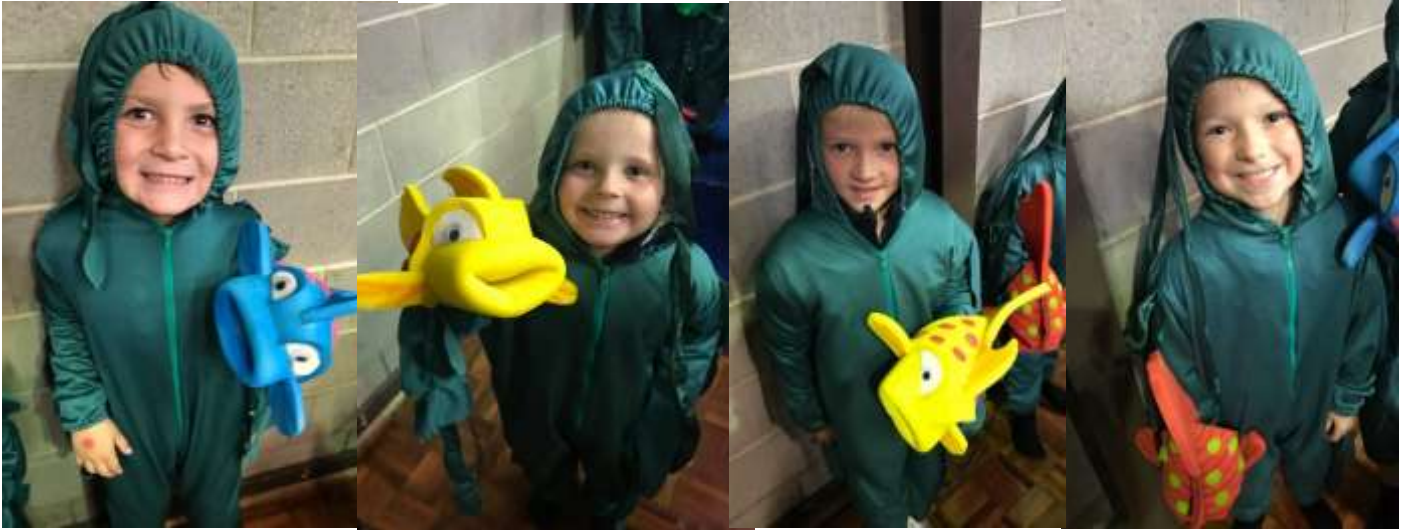
The POSSUM'S danced up the FRONT in a dance called 'Under the Sea' and loved it!